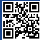
Leadership Scott County Agriculture Day