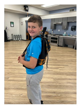
Last day of sewing for Unit 2 & 3!