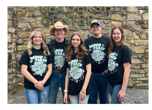
Area C1-C4 Delegates at 4-H Teen Retreat at Lake Cumberland 4-H