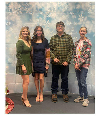
State & District 4-H Leaders