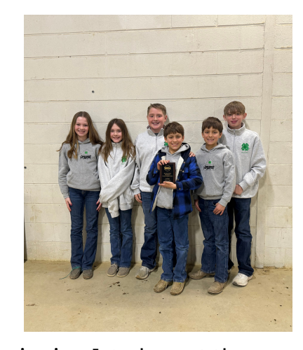
Congratulations to our junior team for winning 1st place at the Morehead State livestock judging contest!